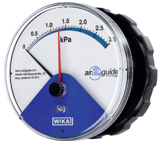
Differential pressure gauge model A2G-10