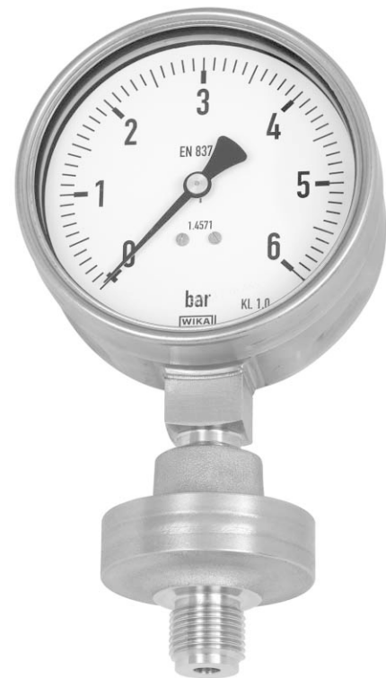
Diaphragm Seal, Economic Design Model 990.38 with Pressure Gauge Model 232.50 NS 100